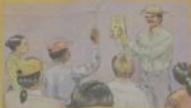
There are Federal rules to protect workers. These rules require that your employer train you in pesticide safety. Estas reglas ayudan para proteger a los trabajadores. Las reglas Federales que se piden de proteger a los trabajadores de pesticidas.

Los pesticidas pueden estar en las plantas o en el suelo, en el agua de riego, o arrastrados por el viento cuando se aplican cerca.