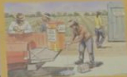
Wash your hands and face before eating, drinking, smoking, changing gear or clothes, or using the toilet. Lavarse las manos y la cara antes de comer, beber, fumar, cambiar el equipo o la ropa, y antes de usar el baño o el retrete.