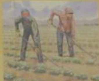
Wear a hat or cap, wear a long-sleeved shirt, long pants, and shoes and socks to protect yourself from pesticides. Usar sombrero o gorra, camisa de manga larga, pantalones largos, y zapatos y calcetines para protegernos de los pesticidas.