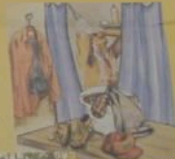
After work, shower or wash your body with soap and water; shampoo your hair.