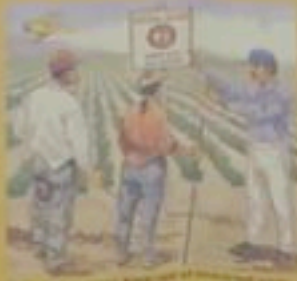
Workers should wear long-sleeved shirts, long pants, and a hat to protect themselves from pesticides.

Pesticides may be on plants and soil, in irrigation water, or drifting from nearby applications.